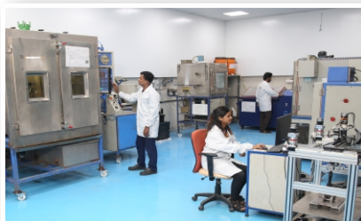
Electronic Parts Validation Laboratory