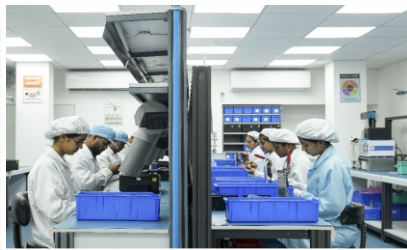
Electronic Manufacturing Assembly Line