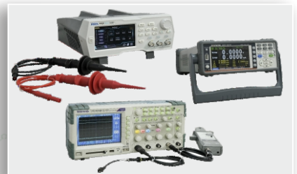
Electronic Product Testing Equipments

11 to 14, Walia Industrial Estate, Opp. Tungareshwar Industrial Complex, Sativali, Vasai (E), Palghar - 401 208 INDIA. Phone : + (91) 81697 92604 / 82911 89445 Email : skg@inensy.com